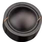
RS 28N Tweeter