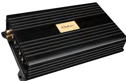
D1200 1200W×1 Class D 1- channel power amplifier

◎ Sound performance: Feel the beauty of low frequency, have sufficient energy, dive deep, and have good dynamic effect.