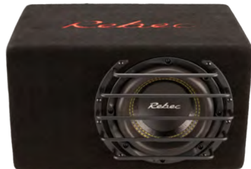
WA8II Active subwoofer

◎ Sound performance: Like the rich and elegant vocal music of the cello, you can experience a touch of sadness and sadness