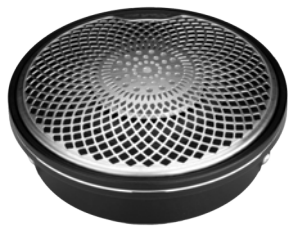
SC-70 2.75" Sky channel speaker

© Sound performance: The sound is highly three-dimensional, providing an immersive music experience