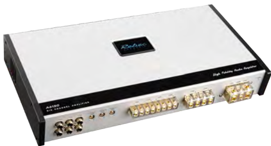
A6150 100Wx4+150W×2 Class AB 6-channel power amplifier