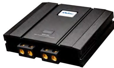
RFX-90 Automotive capacitor