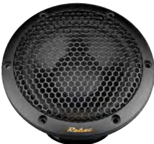
RS 104 Mid-range speakers