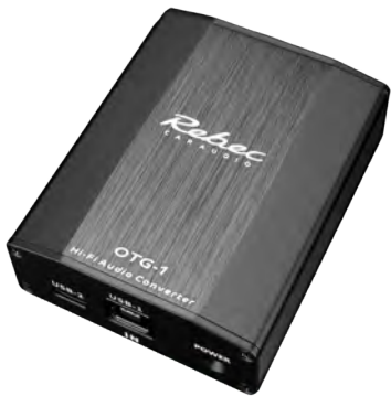
OTG-1 Technical Parameter