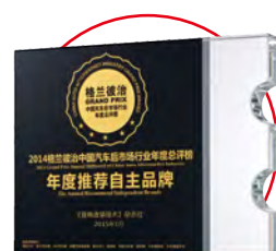
2014 - 2015 Recommended brand award of the year from Grand Prix Annual Billboard of China Auto Aftermarket industry

Rebec has been awarded the Numerous awards by professional organizations, The public's recognition is the biggest affirmation Inspired the Rebec to go higher, and it is to inspire the Rebec team to keep forward on the car audio market. Every achievement we have made embodies the wisdom and dream of the Rebec team. Behind every glory is the accumulation and precipitation of the past.