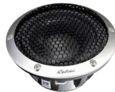
LS104 Grey Mid-range speakers