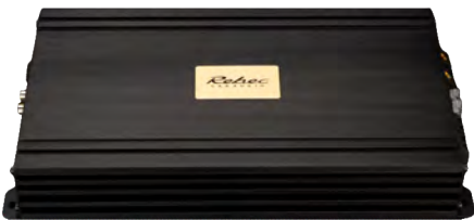
RE160 135W×2 Class AB 2-channel power amplifier

◎ Sound performance: Warm, mellow, thick, bright and energetic.