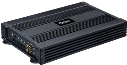
RA200 200W×2 Class AB 2-channel power amplifier

◎ Sound performance:Sufficient power, strong resolution, good imaging effect, and exquisite and true timbre.