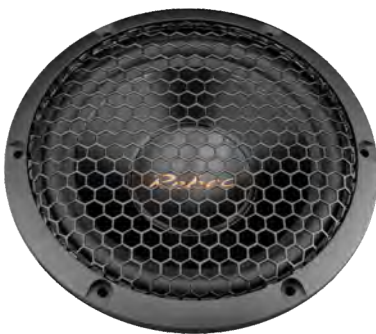
RS 165 Bass Speaker (grill optional)