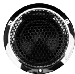
EX50 Chrome Technical Parameter