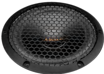
RS 200 Bass Speaker (grill optional)