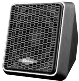
SA70 Square center speaker

© Sound performance: Immersive sound experience. Dynamic 4D panoramic sound