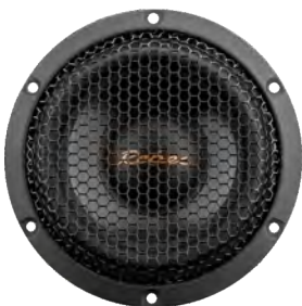
RS 90 Mid-range speakers