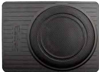
U10V2 Active ultra-thin bass

◎Sound performance: Full low frequency, solid strength, good imaging effect, easy installation, no space