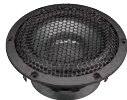
RC90 Technical Parameter