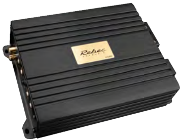
D600 600W×1 Class D 1- channel power amplifier

◎ Sound performance: Feel the beauty of low frequency, have sufficient energy, dive deep, and have good dynamic effect.