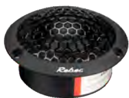
RS 28 Tweeter