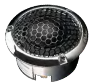
EX28 Chrome Tweeter