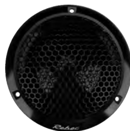
EX50 Black Technical Parameter