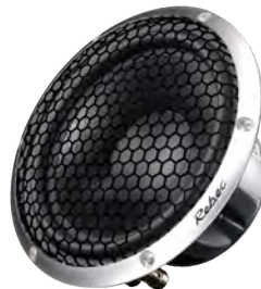
LS165 Grey Bass Speaker (grill optional)