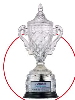
2015 Car audio Modified Masters Quarterfinals of the AEA China (International)

2010: won the "Overflight Progress Award" 2013-2017 : "Consumer Satisfaction Brand" 2011-2017 : "Top 10 Car Audio Brands" 2014-2015: Successively awarded the "Annual Outstanding Independent Brand" 2012-2018: Won the car audio professional competition Champion, runner-up, third runner-up, etc 2013-2016: "HI-FI Fever Audio Brand" 2014: we successfully qualified for the "Top Eight" of AEA International competitions