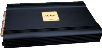
RE120 120W×4 Class AB 4-channel power amplifier

◎ Sound performance: Warm, mellow, thick, bright and energetic.