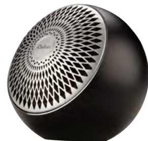
BL-80 3" Super center speaker