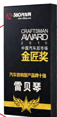
2013 - 2017 Craftsman award of the 360qc.com