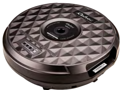
WB11 Active spare wheel subwoofer

◎Sound performance: Low frequency compensation, sufficient sense of quantity, deep dive, convenient installation does not occupy space