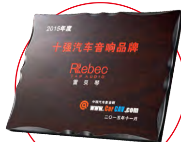
2011 - 2018 Top 10 car audio band of the www.carcav.com