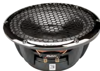
EX165 Chrome Technical Parameter (grill optional)