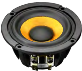
RL70 2.5" Full frequency mid range speaker

© Sound performance: Immersive sound experience. Dynamic 4D panoramic sound