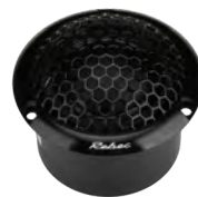
EX28 Black Tweeter