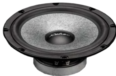
RC200 Technical Parameter