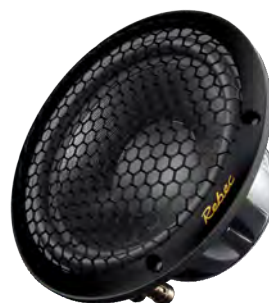
LS165 Black Bass Speaker (grill optional)