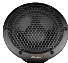
LS104 Black Mid-range speakers