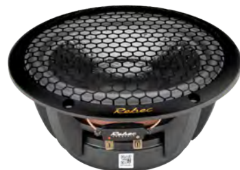
EX165 Black Technical Parameter (grill optional)