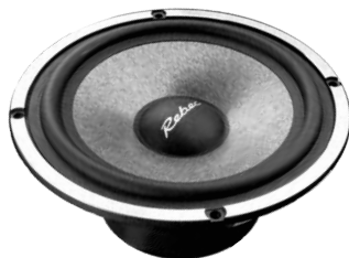
RC165 Technical Parameter